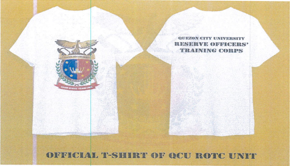
OFFICIAL T-SHIRT OF QCU ROTC UNIT