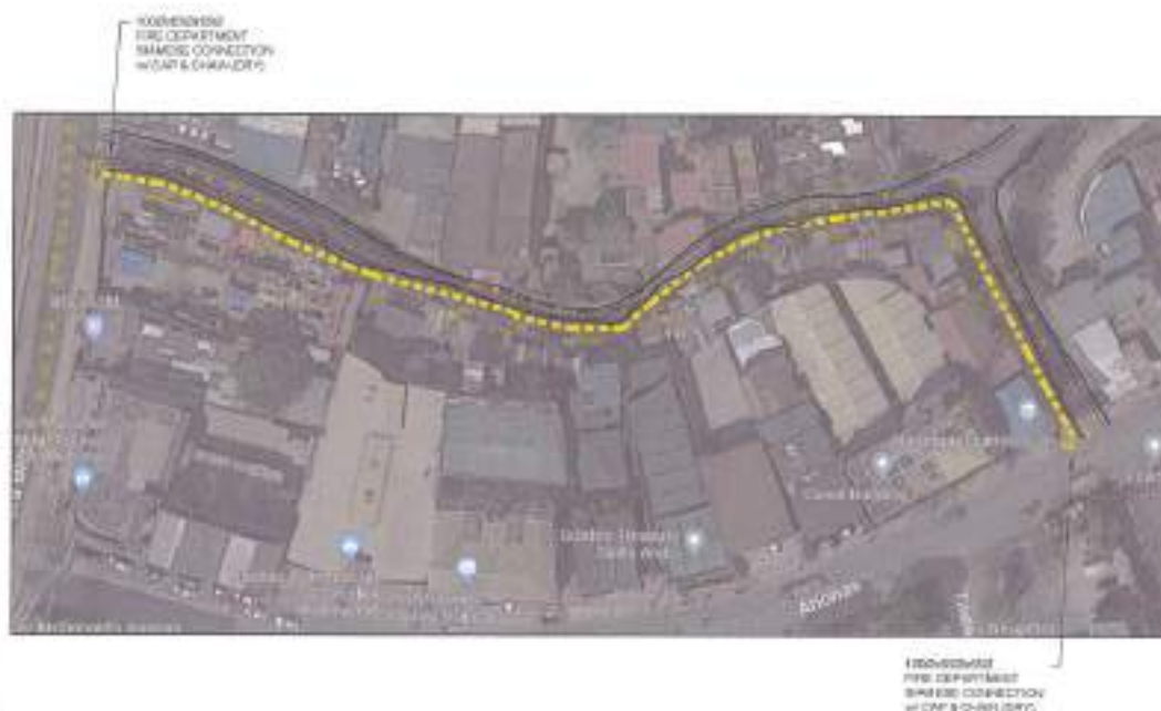
3 SITE DEVELOPMENT PLAN