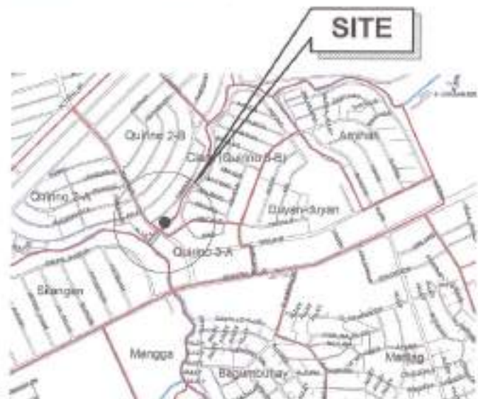
2 VICINITY MAP